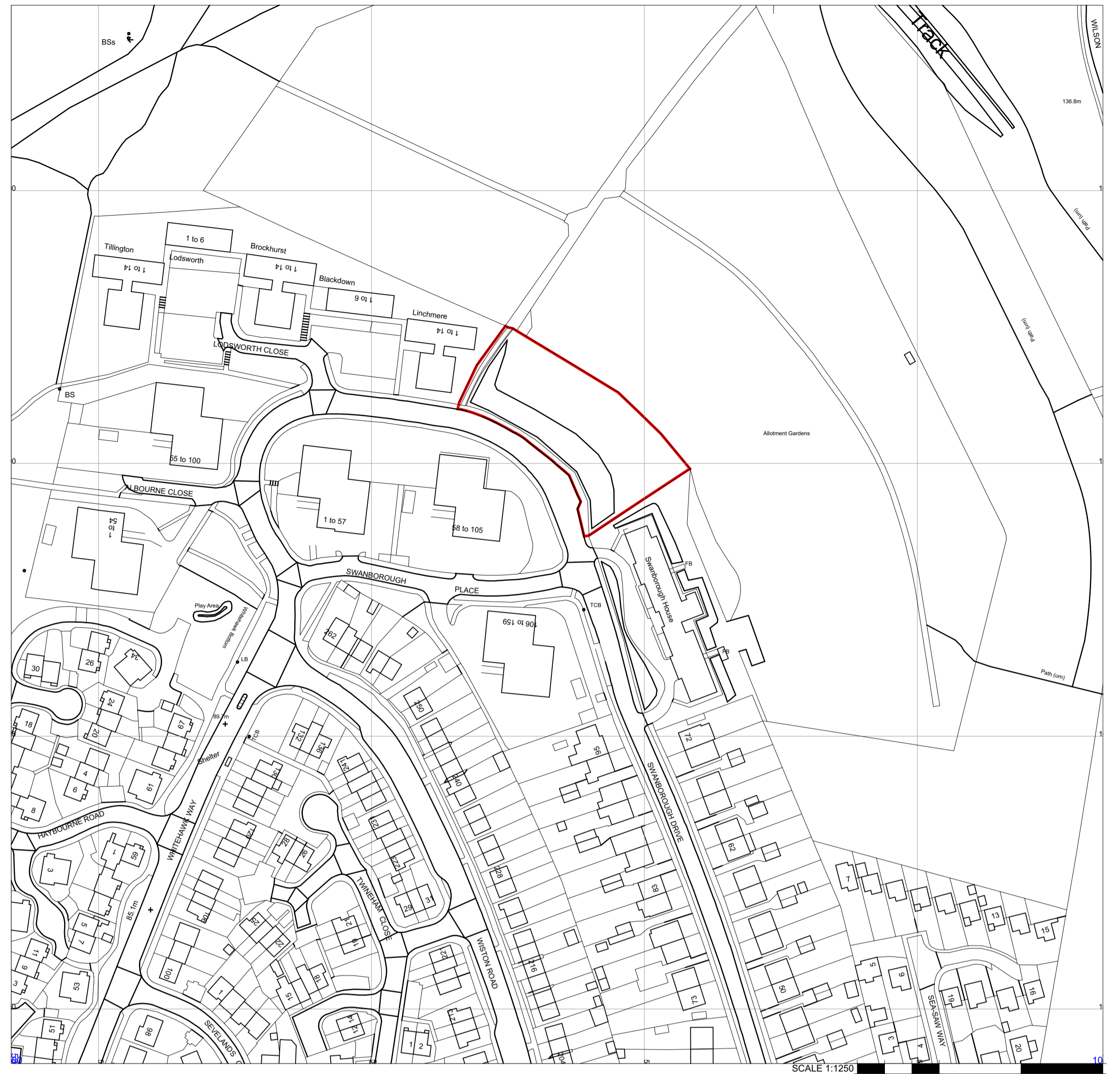
Location Plan SCALE 1:1250 90m 1:1250