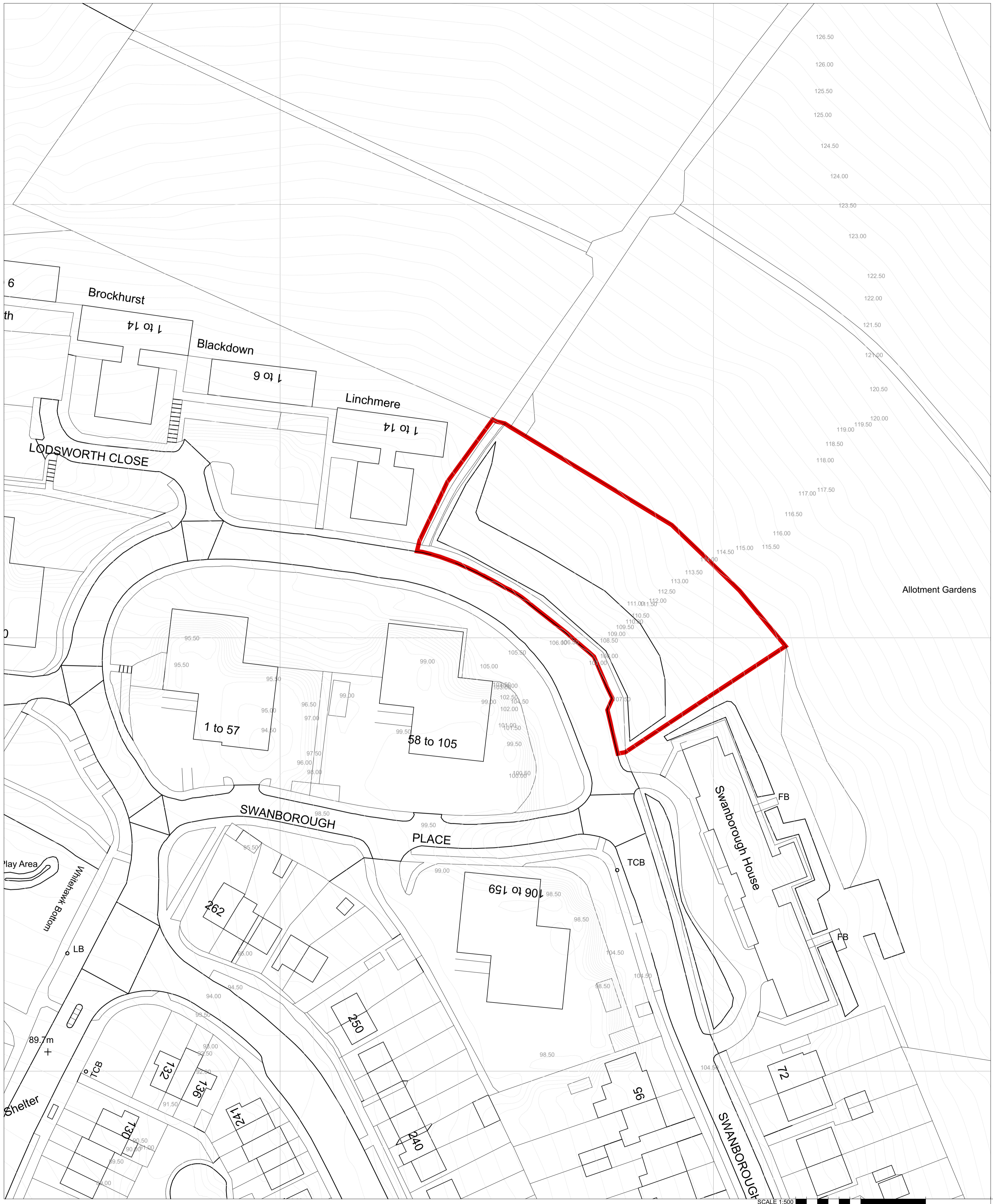
Block Plan SCALE 1:500 45m 1:500